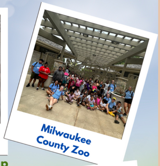
Milwaukee County Zoo