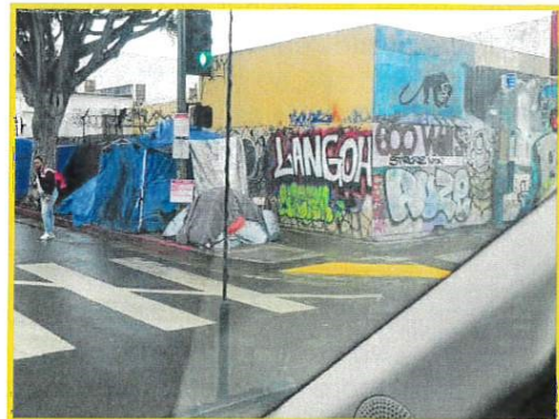
Skid Row Neighborhood