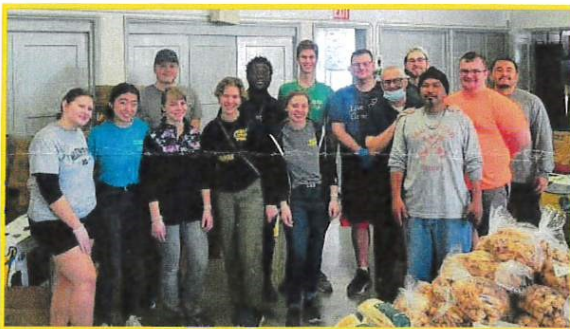
Peace Mission Team and other volunteers serving at St. Paul Lutheran Food Pantry.