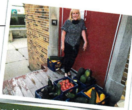
Breaking the Chains Church shares their harvest!

Both of these stories are available at milwaukeesynod.org/stories