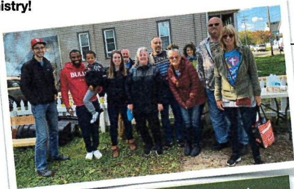
Leaders from across Kenosha collaborate on a community garden

Included with this letter is a paper copy of the "Statement of Intent," like a congregational pledge of support for the larger impact we make together. If you would rather save a stamp and fill this out online, use the form in this third section of the website to do so. Otherwise, return the enclosed paper copy to the synod office after your congregation's 2022 budget is approved. Consider using the included "Mission Support Litany" to help your congregation know and feel the impact of their part of our shared ministry!