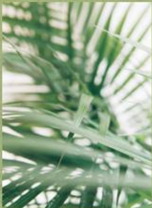
Palm Sunday 4/5 - 9:30am