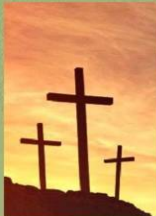
Easter Sunday 4/12 - 9:30am