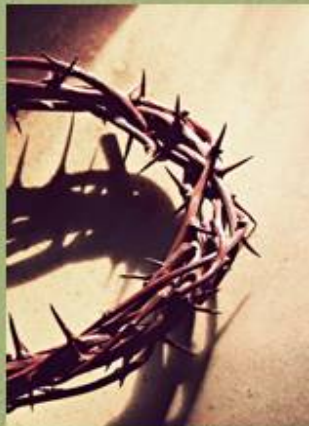
Good Friday 4/10 - Noon